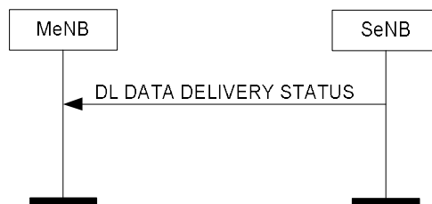
Figure 5.4.2.1-1: Successful Downlink Data Delivery Status

After being reported to the MeNB, the SeNB removes the respective PDCP sequence numbers.