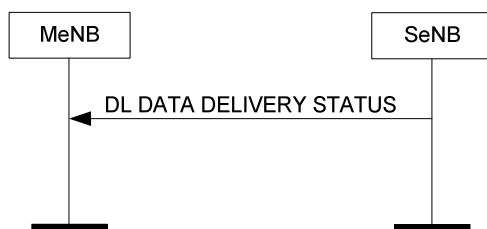
Figure 5.4.2.1-1: Successful Downlink Data Delivery Status

After being reported to the MeNB, the SeNB removes the respective PDCP sequence numbers.