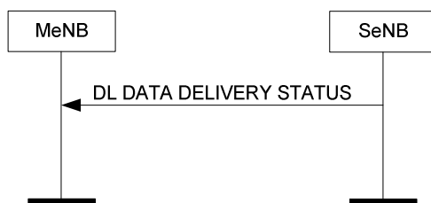
Figure 5.4.2.1-1: Successful Downlink Data Delivery Status

After being reported to the MeNB, the SeNB removes the respective PDCP sequence numbers.